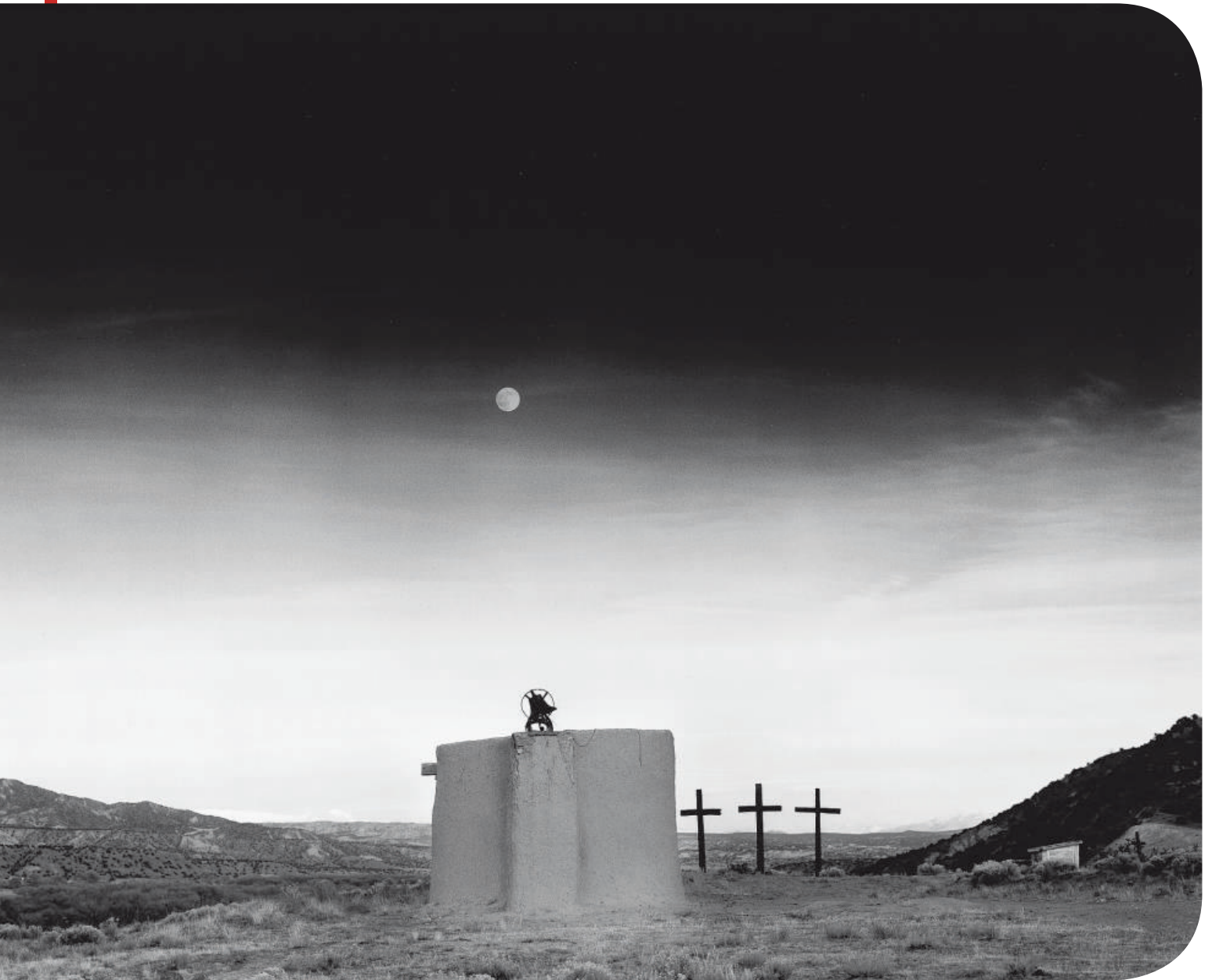
Moonrise Over Penitente Morada. Dusk, late autumn, New Mexico, 1991.